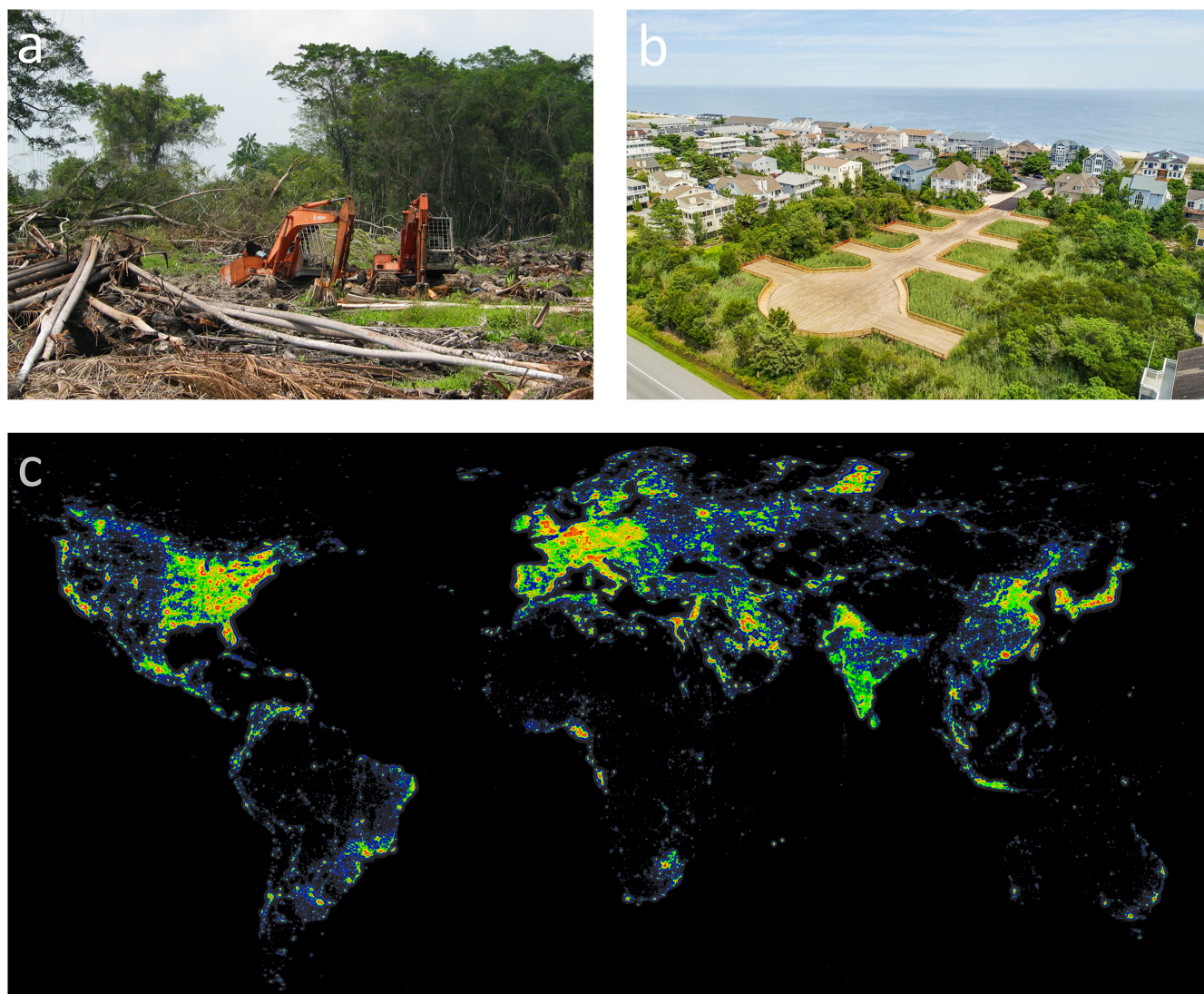
Figure 3. Among the top threats to fireflies globally are habitat loss and artificial light at night. (a) In Malaysia, clearing of riverbank mangroves along the Selangor River for agriculture and aquaculture destroys display trees used by Pteroptyx adults for courtship, and disturbs larval habitat. (b) In Delaware, residential development threatens declining populations of Photuris bethaniensis that are restricted to interdunal freshwater swales. (c) Global map of ALAN based on 2006 satellite data, colors indicate ratio of artificial to natural sky brightness: yellow represents 1–3 times brighter, orange represents 3–9 times brighter, red represents 9–27 times brighter. Map by David Lorenz, https://djlorenz.github.io/astronomy/lp2006 .

Water pollution. Across Asia and in South America, the respondents identified agricultural and industrial runoff containing fertilizers, pesticides, and other water-borne pollutants as the third or fourth most serious threat (table 2). In contrast to the mainly terrestrial larvae of Nearctic fireflies, numerous Asian fireflies have aquatic larvae that inhabit freshwater ponds, rivers, and streams, where they feed and develop through several larval instars (Lloyd 2008). This stage typically lasts for several months, during which both larvae and their snail prey will be exposed to water-borne pollutants.